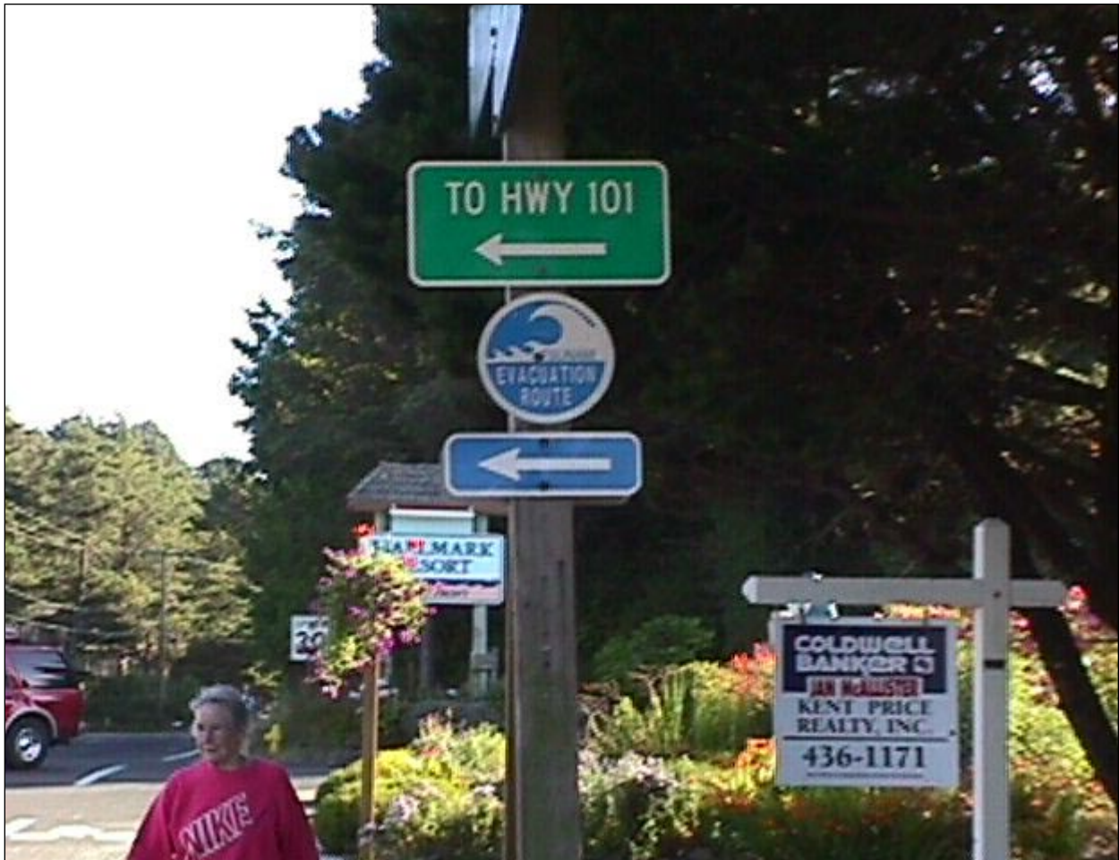
Cannon Beach: Evacuation route signs at the corner of S. Hemlock and Sunset Boulevard. Note that the curl of the wave is in the uphill direction.