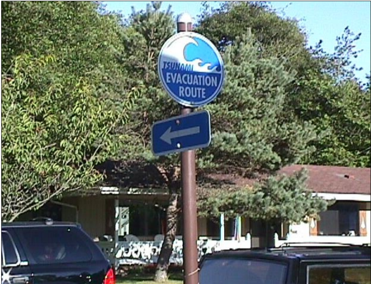
Cannon Beach: Evacuation route sign at the corner of Sunset Boulevard and S. Spruce. Note that in this sign orientation the arrow sign is the determiner of the direction of evacuation, not the curl of the wave on the evacuation route sign.